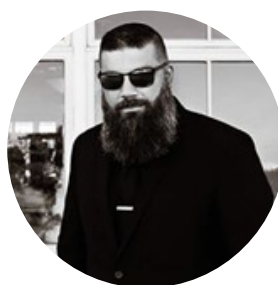
Justin Darling DARLING WEDDING PRODUCTIONS