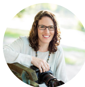
Amanda White ARWHITE PHOTOGRAPHY